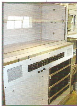
Custom interior cabinetry