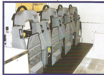
Custom interior seating arrangements