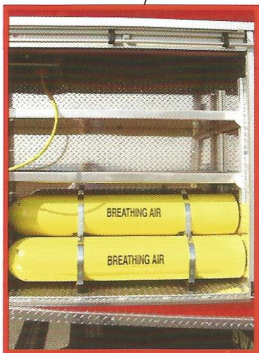
Maximum utilization of compartment space