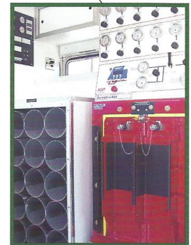
Custom interior fill station installations