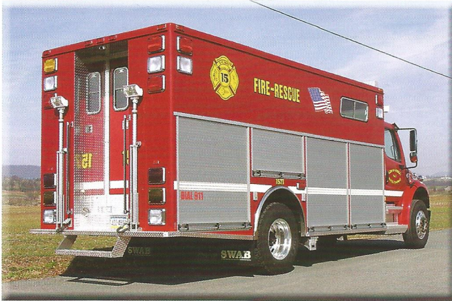
Grand Gorge Hose Company No. 1 Grand Gorge, NY