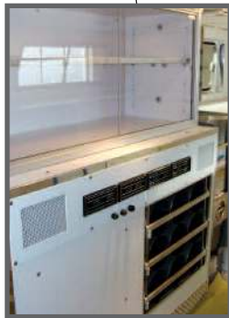
Custom interior cabinetry