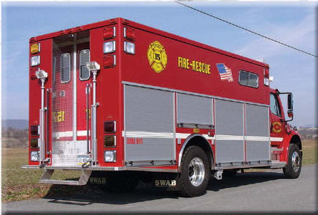
Grand Gorge Hose Company No. 1 Grand Gorge, NY