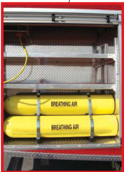
Maximum utilization of compartment space