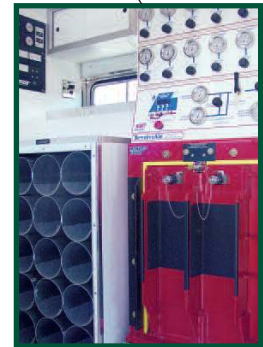
Custom interior fill station installations