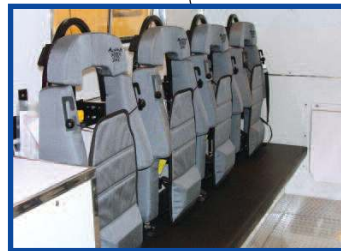
Custom interior seating arrangements