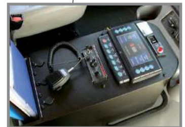
Custom cab center consoles