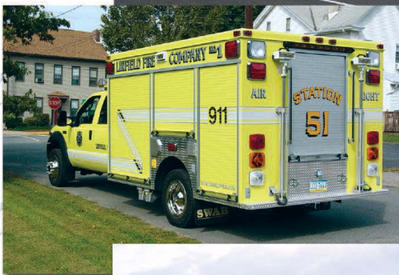
Champion-12, Linfield Fire Company No. 1, Linfield, PA