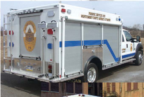
Montgomery County Office of District Attorney Norristown, PA Champion-12