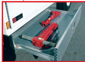
Custom under-body drawer