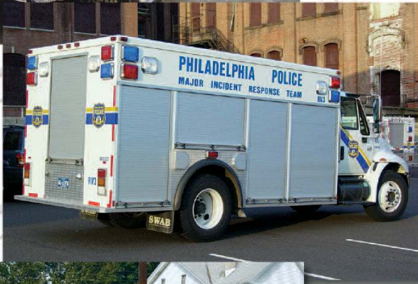
Champion-16, Philadelphia Police Counter-Terrorism Unit, Philadelphia, PA