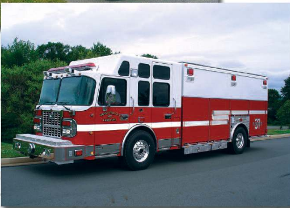
Champion-20, Union Fire Company, Leesport, PA

SWAB Wagon Company, Inc. 44 South Callowhill Street • P.O. Box 919 Elizabethville, PA 17023 Phone 800-834-7922 • Fax 717-362-4579 www.swabwagon.com