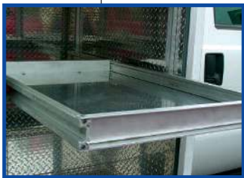
450 lb. capacity pull-out tray