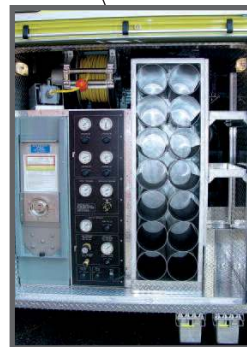
Custom air system installations