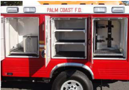
Custom Air Pack Storage