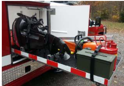
Heavy Duty Dual Direction Tray