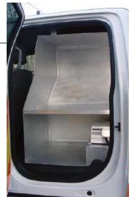
Custom Cab Storage Solutions