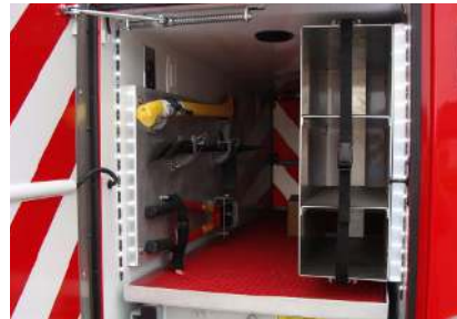
Oxygen Bottle Storage Custom Tool Mounting